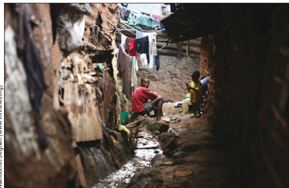
Figure 2: A slum of Kibera

According to WHO, almost 137 million people in urban populations have no access to safe drinking water, and more than 600 million urban dwellers do not have adequate sanitation. 21 The situation is particularly alarming in congested cities of sub-Saharan Africa (figure 2). In Nigeria for example, only 3% of residents from Ibadan have access to piped water, and in Greater Lagos, only 9% of its 10 million residents have access. 4 Unsafe water sources and inadequate sanitation and hygiene are prime contributors to diarrhoeal infections and might lead to cholera endemicity. 22 The overall prevalence of diarrhoea can be very high in cities as shown by data from northern Jakarta, Indonesia, where