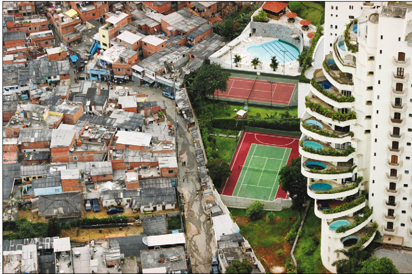
Figure 3: Socioeconomic disparities in Paraisópolis, São Paulo The urban environment is characterised by important socioeconomic disparities and geographical heterogeneity. In Paraisópolis, São Paulo, Brazil, high-income housing is just two steps away from the favela shacks.

hospitals, multispeciality hospitals, and a network of public dispensaries and private clinics, coverage indicators for reproductive and child health are inferior in impoverished neighbourhoods. 53 In the slums of Nairobi, Kenya, tumbledown, private-owned, and unlicensed clinics might be the only health facilities to which residents have access. 54 Access to vaccination is also an issue for poorer urban residents, and in sub-Saharan Africa, rapid rates of urbanisation are associated with negative outcomes in access to vaccination. 55 Differential access to medication might result in the emergence of resistance in the urban environment, (eg, malaria resistance to chloroquine 56 ). The number of cases of multidrug-resistant (MDR) tuberculosis is also rapidly increasing in several cities. 57 For Baku, Azerbaijan, this increase is particularly daunting: among newly diagnosed cases of tuberculosis, the proportion of single-drug resistant and MDR tuberculosis are 56.3% and 22.3%, respectively. Surveys have also reported alarming rates of MDR tuberculosis in Tashkent, Uzbekistan, Mumbai, India, Dhaka, Bangladesh, and Cape Town, South Africa. 57–59